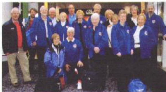
Renfrewshire curlers ready for the off.